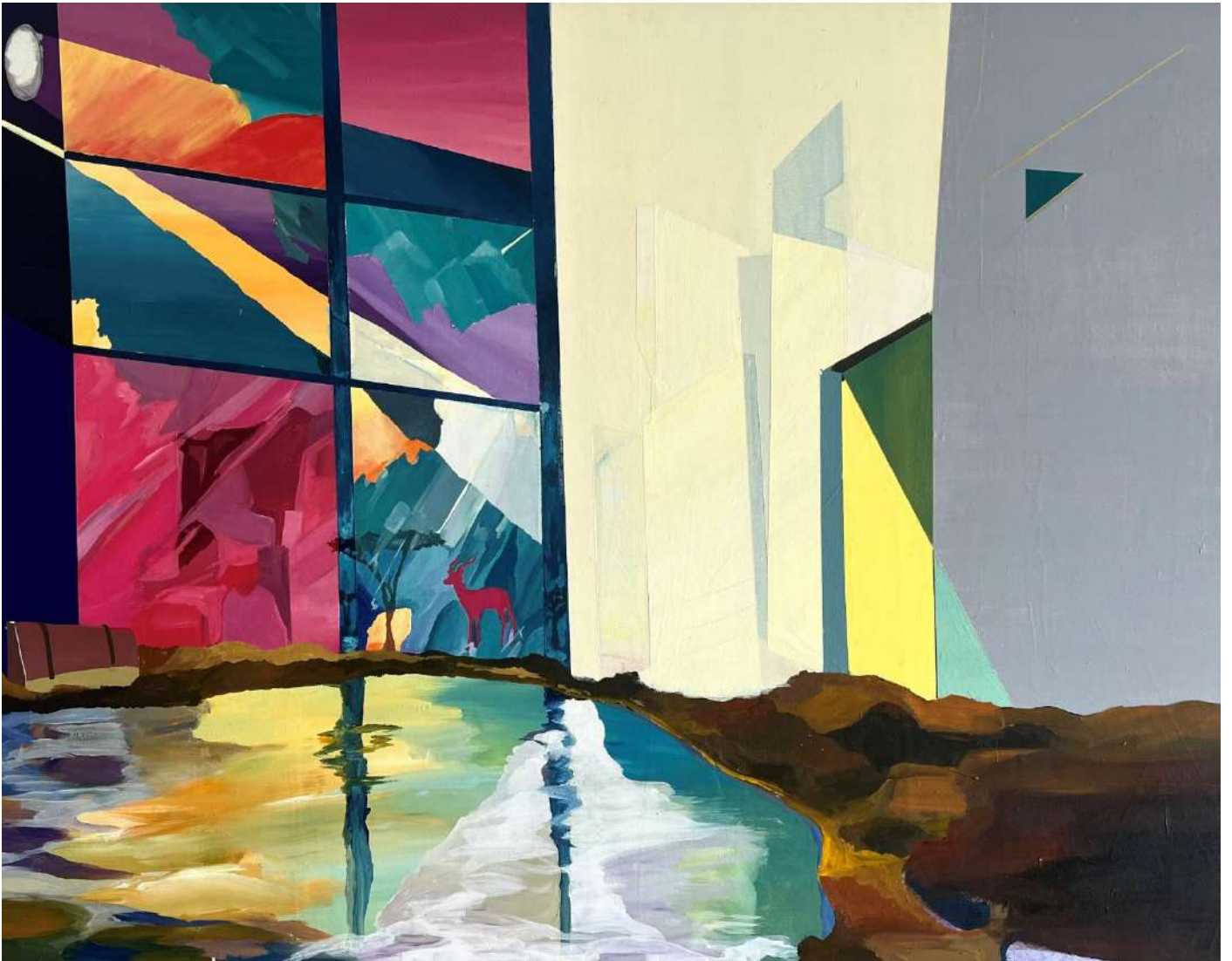
In the Shadows , Acrylic on canvas, 107 x 137cm, 2025