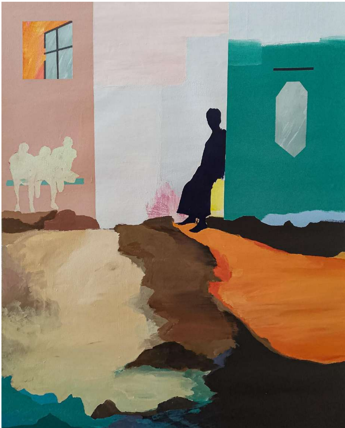
Her Reproach , acrylic on canvas, 89.8 x 74cm, 2025, Framed