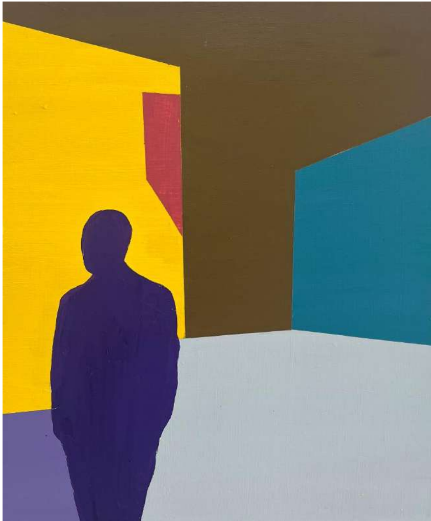
Phago , Acrylic on MDF Board, 48 x 40cm, 2025