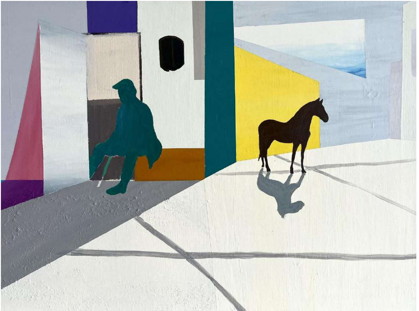
When Man Rode Horses , Acrylic on canvas, 64 x 86cm, 2025