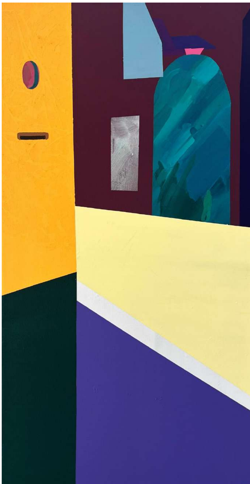
Kisani Blues , Acrylic on canvas, 130 x 70cm, 2025