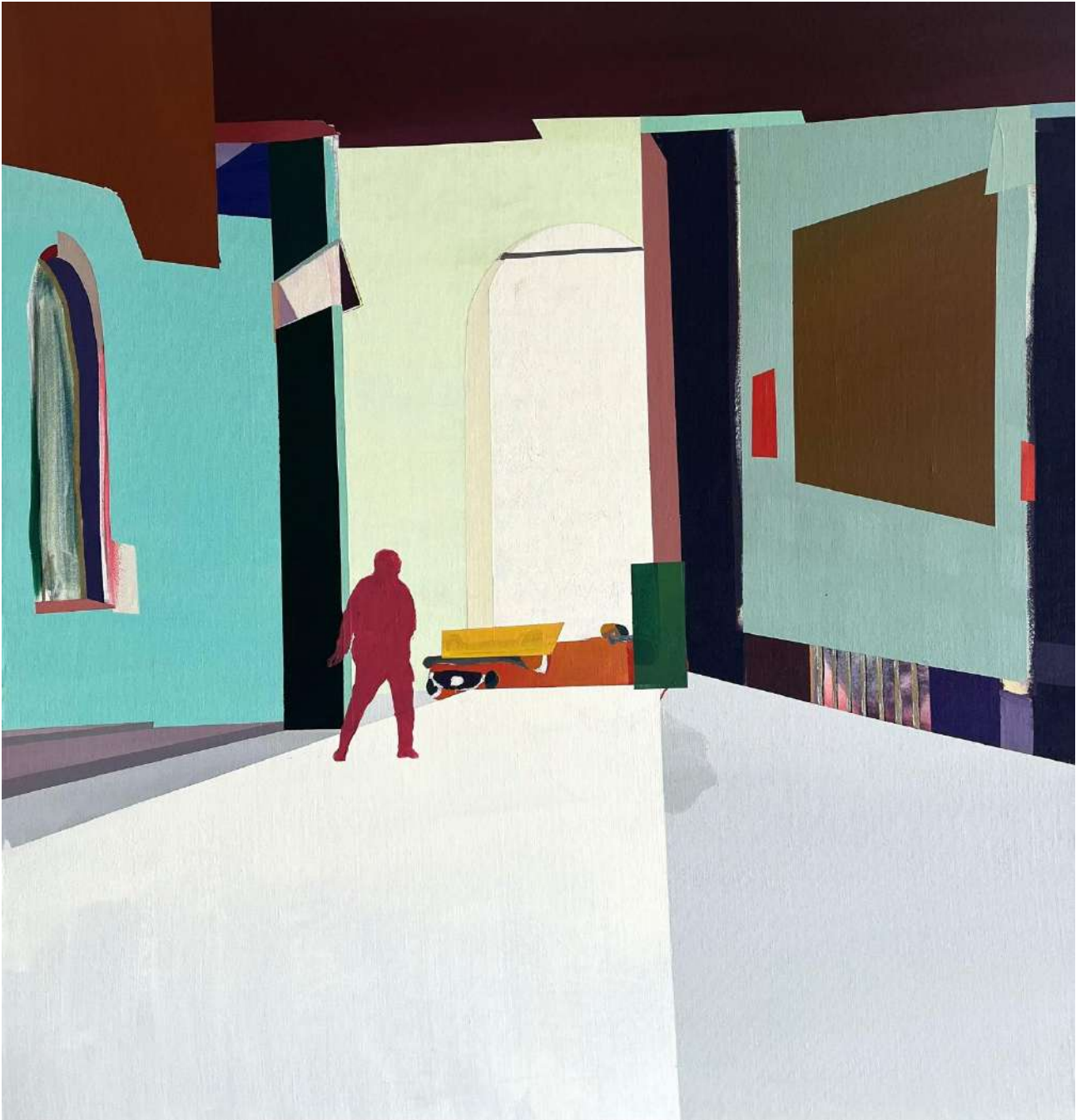
Ship-wrecked , Acrylic on canvas, 96 x100cm, 2025