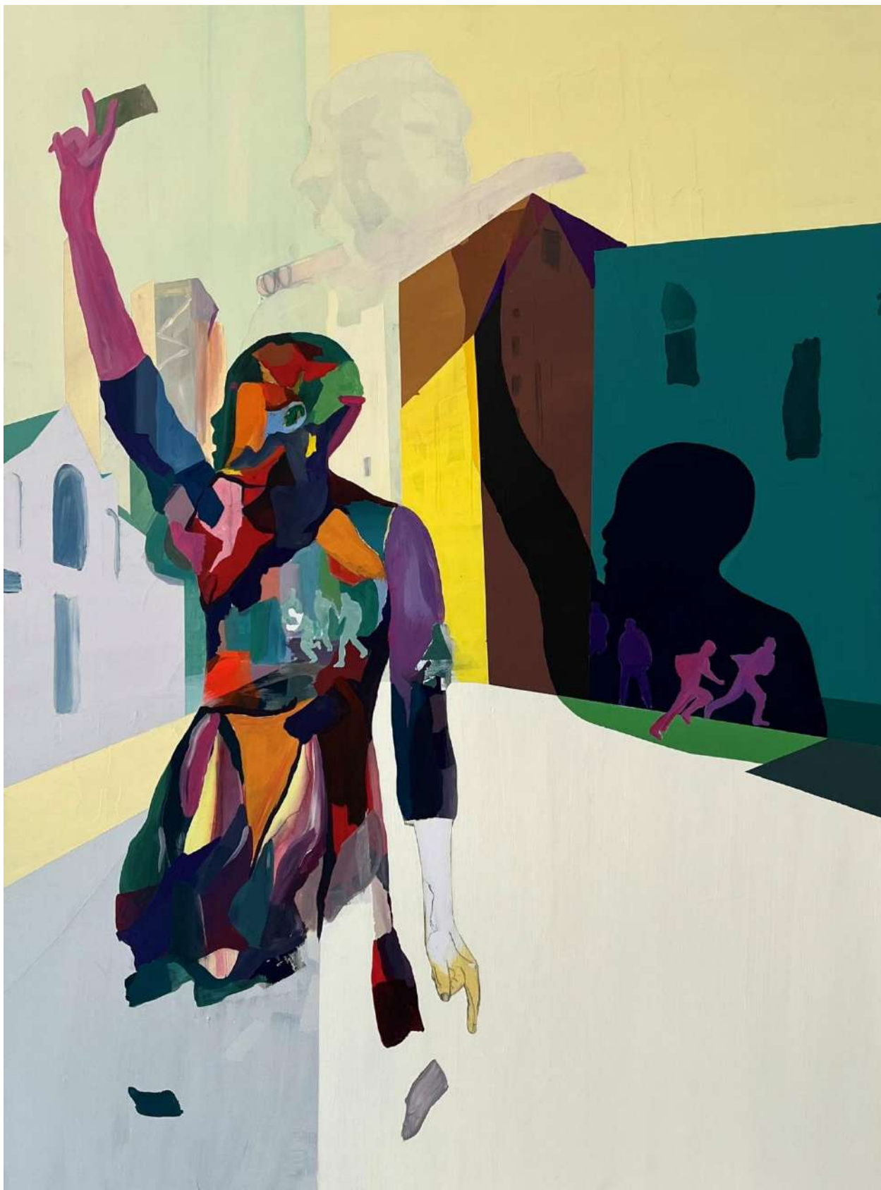
Stained Glass: Wisdom vs Folly , Acrylic on canvas, 122 x 91.5cm, 2025