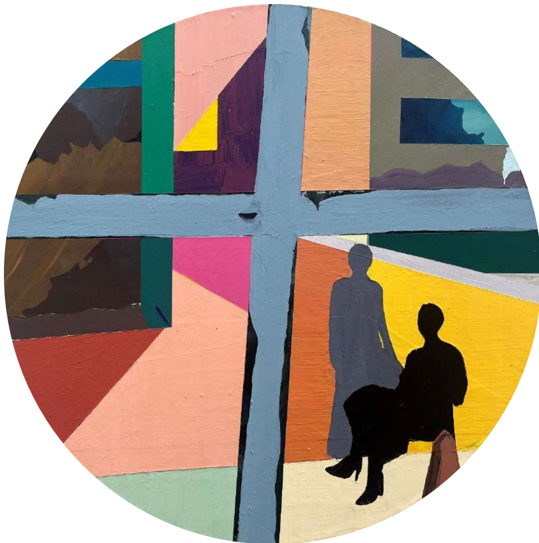
Bongeka: The Tikana Case , Acrylic on MDF, 40cm Diameter, 2025