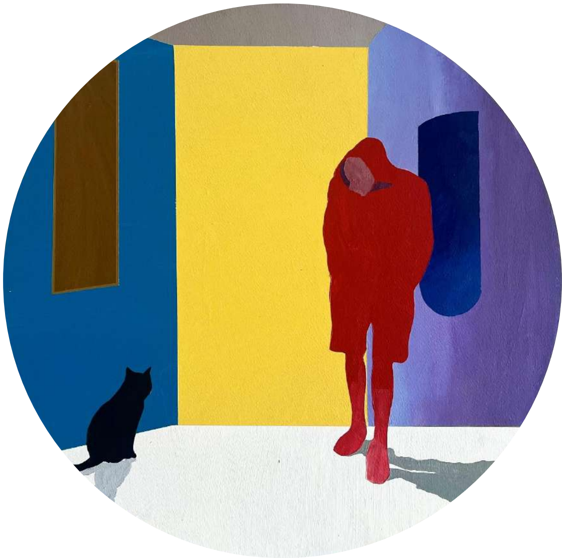
Curiosity and Envy , Acrylic on MDF, 40cm Diameter, 2025