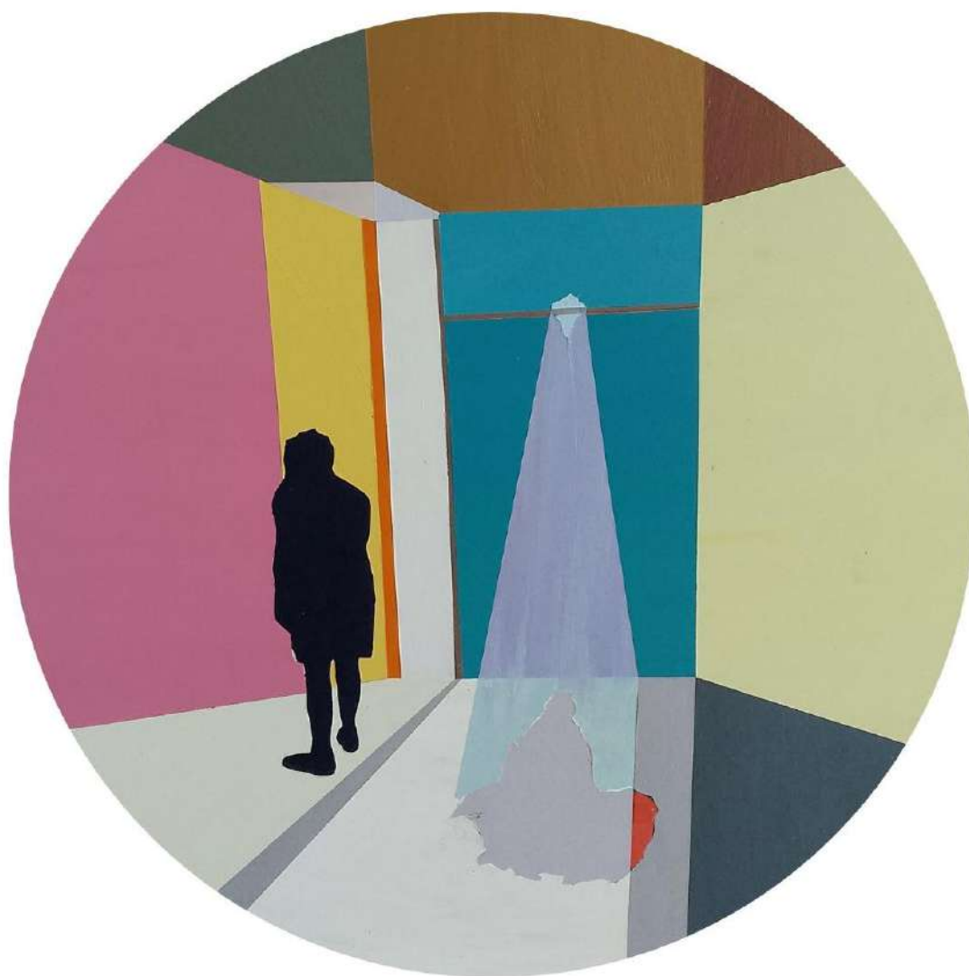
African Perspective , Acrylic on MDF, 40cm Diameter, 2024