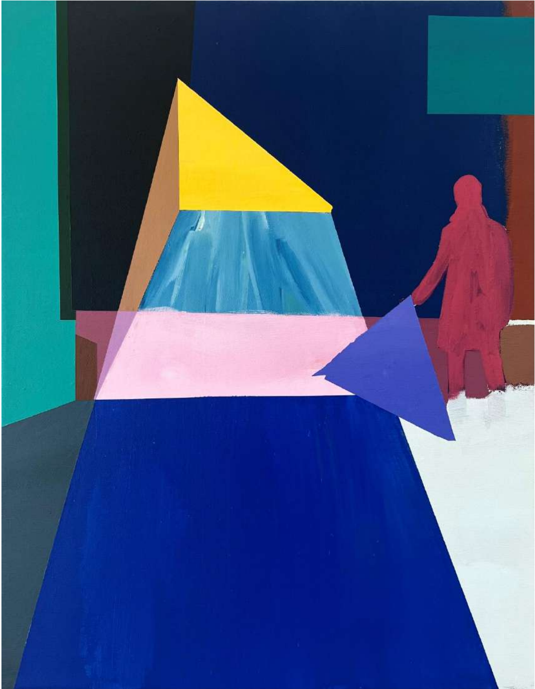
Temptation , Acrylic on canvas, 86 x 67cm, 2025